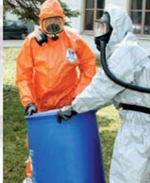
Disposal of contaminated soil, disassembly of industrial