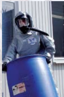
Disposal of contaminated material.