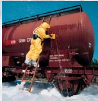
Salvage and clean-ups.