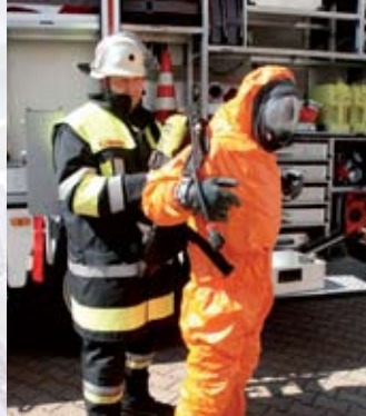
Coverall for first responders, decontamination jobs, clean-ups after accidents involving hazardous substances (e.g. on road or rail), missions in A-B-C situations, closure, salvage and clean-up jobs.