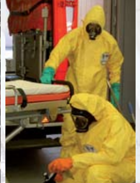
Transporting infectious patients, missions in A-B-C situations