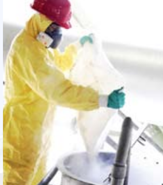
Maintenance work on pipes and containers, including those under pressure, cleaning industrial plants and tanks, production and packaging.