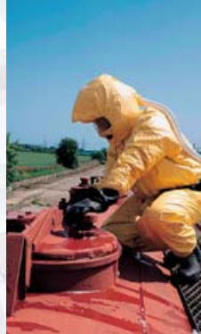
Transport of hazardous substances, storage.